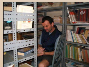
An enthusiastic learner browsing through SACAR library

I consider my joining this course through SACAR as a God given opportunity to know about this great seer, philosopher, nationalist and saint. I pray that this relationship does not end here and that his examples continue to lead me in my endeavours and new manifestations in later life.